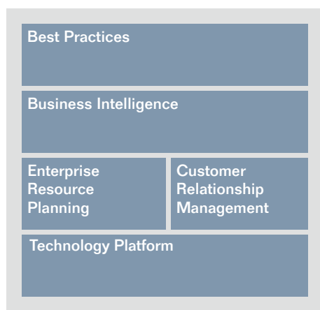
SAP® Business All-in-One – An Integrated Solution

business gains the same functionalities as those employed by large global firms (see the figure).